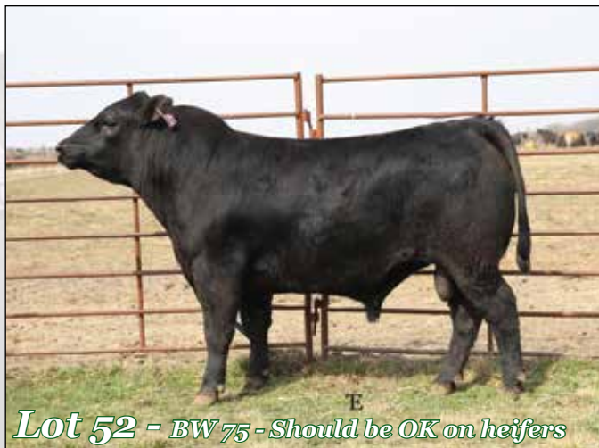
Lot 52 - BW 75 - Should be OK on heifers