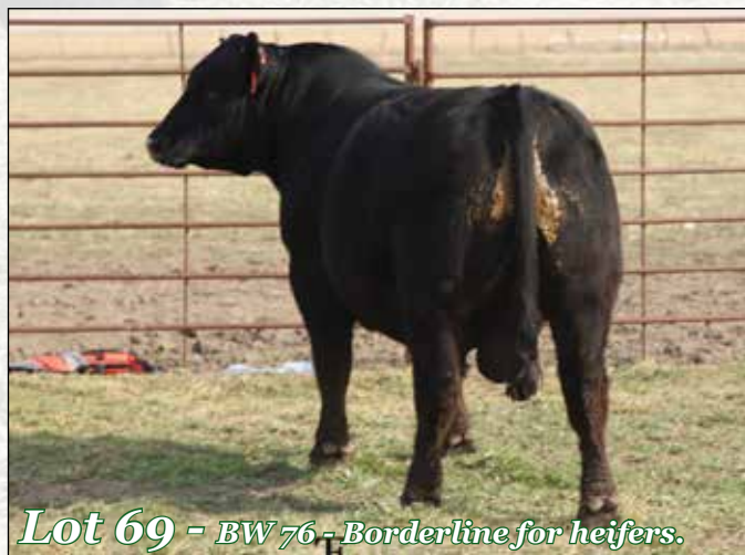
Lot 69 - BW 76 - Borderline for heifers.