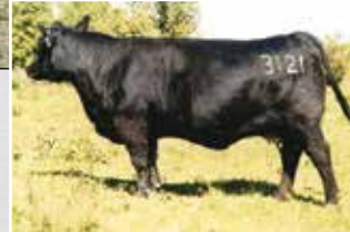
Jauer 7318 DBL 3121 039 Foundation Donor for Lots 61 & 62.