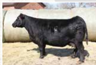
FCC Juanada 855S She sells as Lot 3!