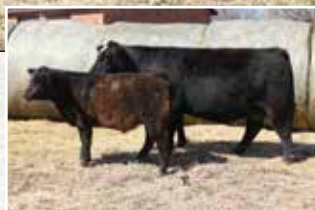
FCC2 Juanada 424B She sells as Lot 30