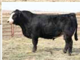
Lot 68 - 16D W/C LnL 1143Y x Lot 22