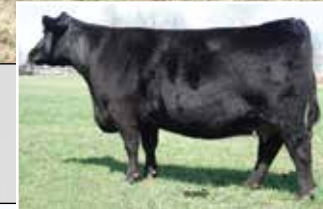
OCC Dixie Erica 963H Maternal Granddam of Lot 58.