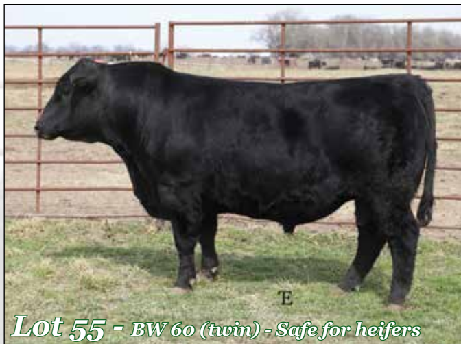
Lot 55 - BW 60 (twin) - Safe for heifers