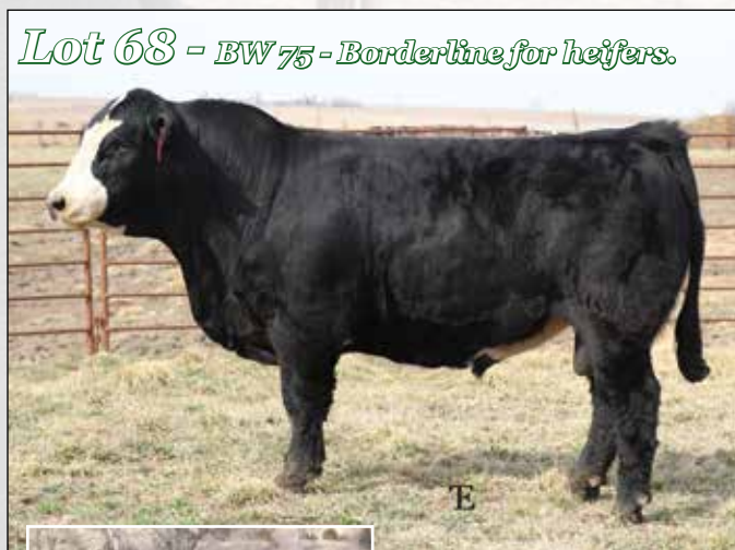
Lot 68 - BW 75 - Borderline for heifers.