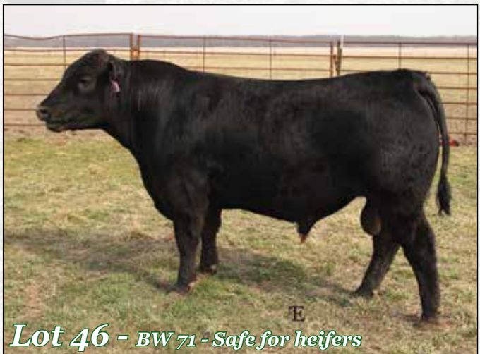
Lot 46 - BW 71 - Safe for heifers