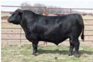
Lot 39 - 96C FCC Yukon 145Y & Rose 812U