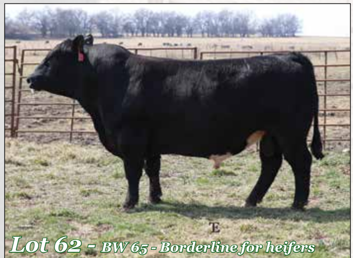
Lot 62 - BW 65 - Borderline for heifers