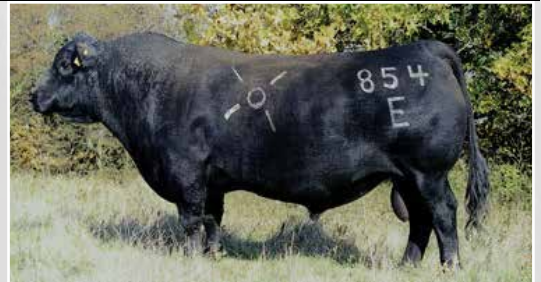
OCC Emblazon 854E - The standard when it comes to producing powerful potent females.