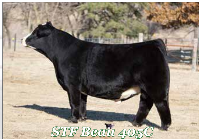
STF Beau 405C

Sired by Broker, a past Triple Crown Champion, and backed by Onyx a Two Time NAILE Champion Simmental Female! EPD's BW 3.3, WW 53, YW 77, Milk 16.8.