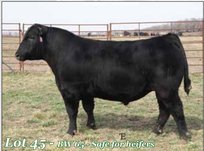
Lot 45 - BW 65 - Safe for heifers