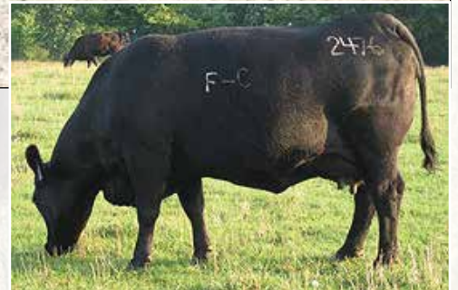
FCC Revolution Rose 2476 Donor Dam of Lot 1