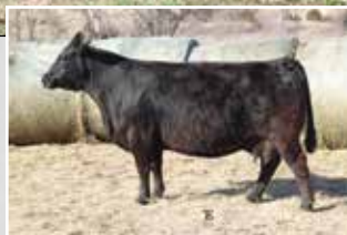
FCC 75X She sells as Lot 22