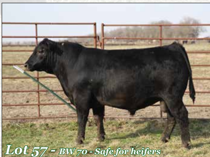
Lot 57 - BW 70 - Safe for heifers