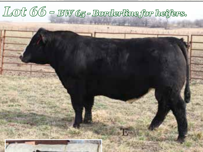
Lot 66 - BW 65 - Borderline for heifers.