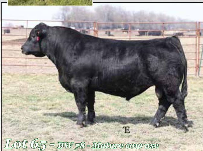
Lot 65 - BW 78 - Mature cow use