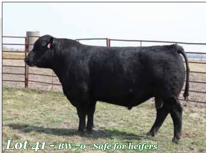
Lot 41 - BW 70 - Safe for heifers