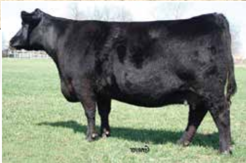
OCC Dixie Erica 963H Donor Dam of Lot 2