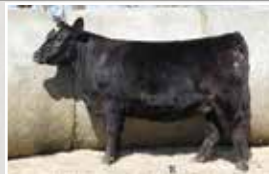
FCC2 Juanada 644D Granddaughter of Lot 6. She sells as Lot 35!