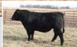
Lot 66 - 23D BWL Movin On x Lot 30