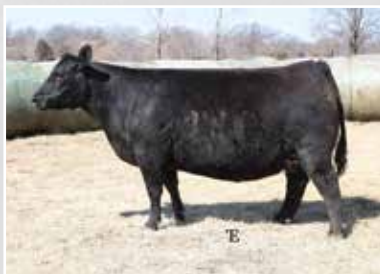
FCC Revolution Rose 812U Dam of Lot 39

You will notice this catalog isn't full of EPD'S and Numbers like most catalogs. These cattle don't vary much in EPD'S since they are genetically so closely bred to one another. The cow families and sire lines in the angus division have virtually the same animals in each and every pedigree as you can see. If you are going to buy with EPD's as your deciding factor; then, you have thousands of places to go to buy your herd bull or next donor and I wish you luck with that. We aren't mating cattle at a computer late at night based on the latest EPD release just to find out later that many of the numbers changed drastically on particular animals. Rather, we are making breeding choices while walking through a pasture and looking at a cows strengths and weakness and deciding what it may take to improve her more so "IN FUNCTION" than on paper. The gene pool has been limited to proven bloodlines that have worked for decades and that is the reason for such uniformity in how these cattle reproduce. These cattle are moderate, easy keeping, maternal oriented and have long been bred for calving ease.