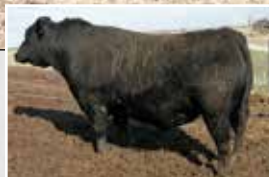
OCC Paxton 730P Sire of Lot 5 and multiple Embryo Packages.