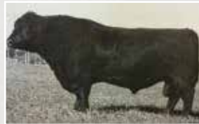
Basin Rainmaker 654X Foundation Sire