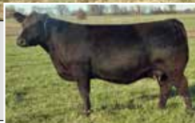
FCC Juanada 928W Maternal Granddam of Lot 64!