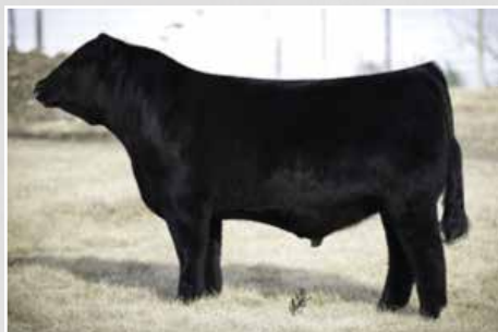
Ruby SWC Battle Cry