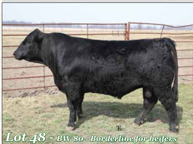
Lot 48 - BW 80 - Borderline for heifers