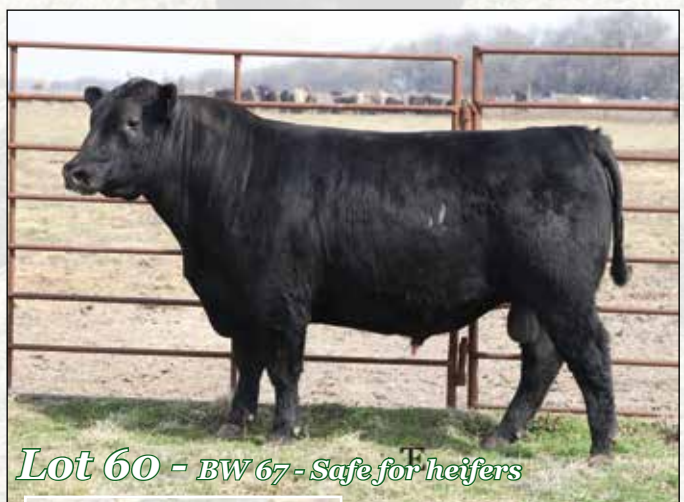
Lot 60 - BW 67 - Safe for heifers