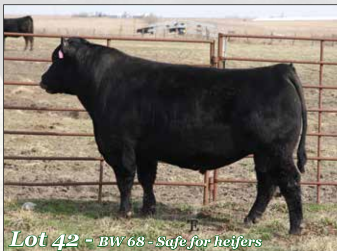
Lot 42 - BW 68 - Safe for heifers