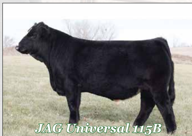
JAG Universal 115B