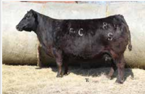
FCC Juanada 854S Maternal Granddam of Lots 50 - 52