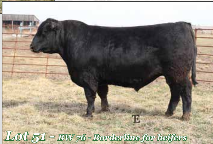
Lot 51 - BW 76 - Borderline for heifers