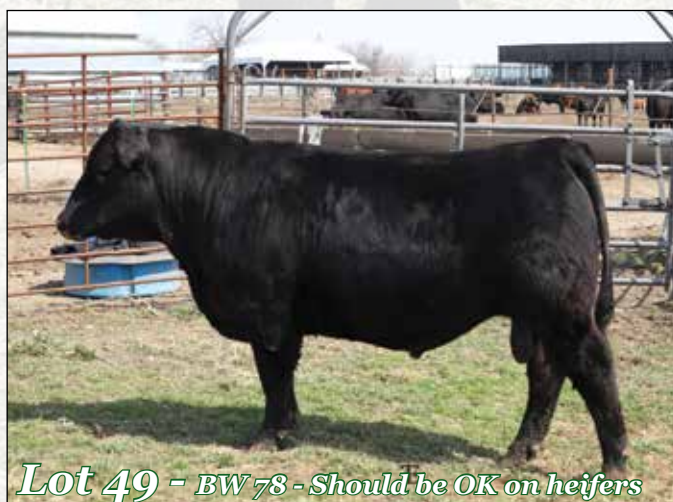
Lot 49 - BW 78 - Should be OK on heifers