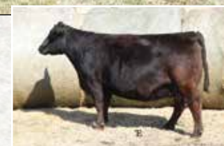
FCC Dixie Erica 163Y She sells as Lot 11!