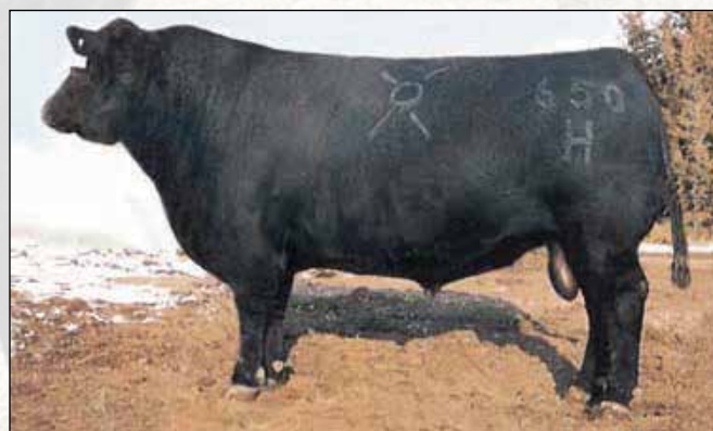
OCC Homer 650H

Bard is a double bred 816B. 816B is a full sister to Emblazon and the dam of Homer. EPD's BW 0.2, WW 32, YW 55, Milk 16.