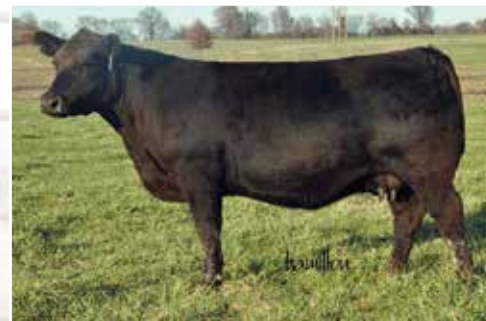
FCC Juanada 928W Dam of Lots 50 & 51