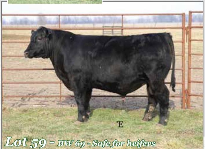
Lot 59 - BW 69 - Safe for heifers