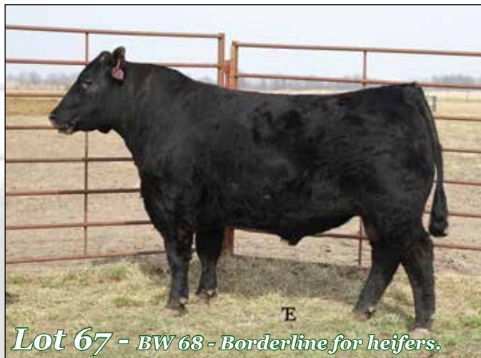
Lot 67 - BW 68 - Borderline for heifers.