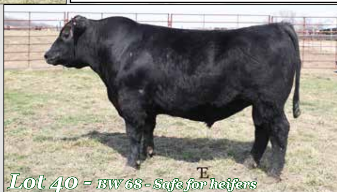
Lot 40 - BW 68 - Safe for heifers