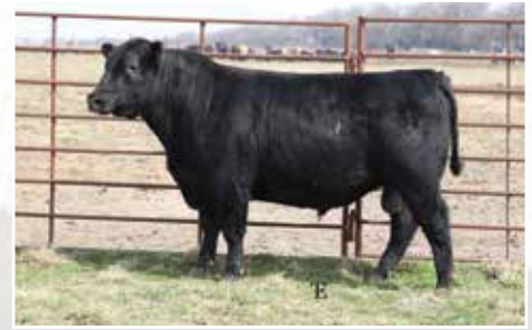
Lot 60 - 8D Grandson of Lot 11