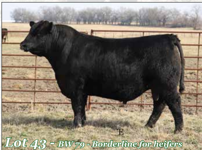
Lot 43 - BW 79 - Borderline for heifers