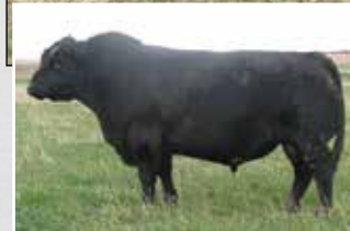
OCC Rear End 751R Full sibling to dam of Lot 44