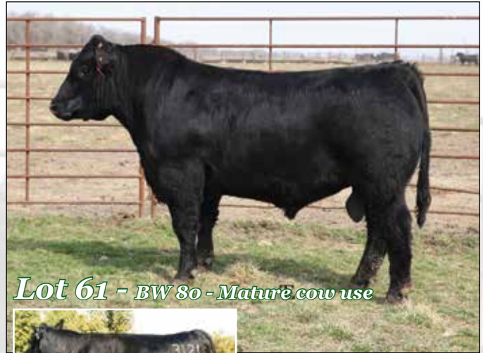
Lot 61 - BW 80 - Mature cow use