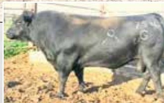
OCC General 794G