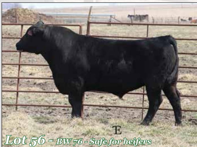
Lot 56 - BW 76 - Safe for heifers