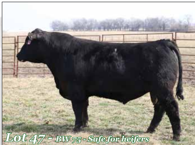
Lot 47 - BW 75 - Safe for heifers