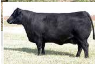
OCC Revolution Rose 887H