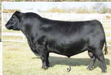
OCC Unmistakable 946U Full sibling to 813U