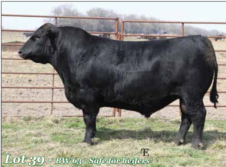
Lot 39 - BW 63 - Safe for heifers

You will notice this catalog isn't full of EPD'S and Numbers like most catalogs. These cattle don't vary much in EPD'S since they are genetically so closely bred to one another. The cow families and sire lines in the angus division have virtually the same animals in each and every pedigree as you can see. If you are going to buy with EPD's as your deciding factor; then, you have thousands of places to go to buy your herd bull or next donor and I wish you luck with that. We aren't mating cattle at a computer late at night based on the latest EPD release just to find out later that many of the numbers changed drastically on particular animals. Rather, we are making breeding choices while walking through a pasture and looking at a cows strengths and weakness and deciding what it may take to improve her more so "IN FUNCTION" than on paper. The gene pool has been limited to proven bloodlines that have worked for decades and that is the reason for such uniformity in how these cattle reproduce. These cattle are moderate, easy keeping, maternal oriented and have long been bred for calving ease.