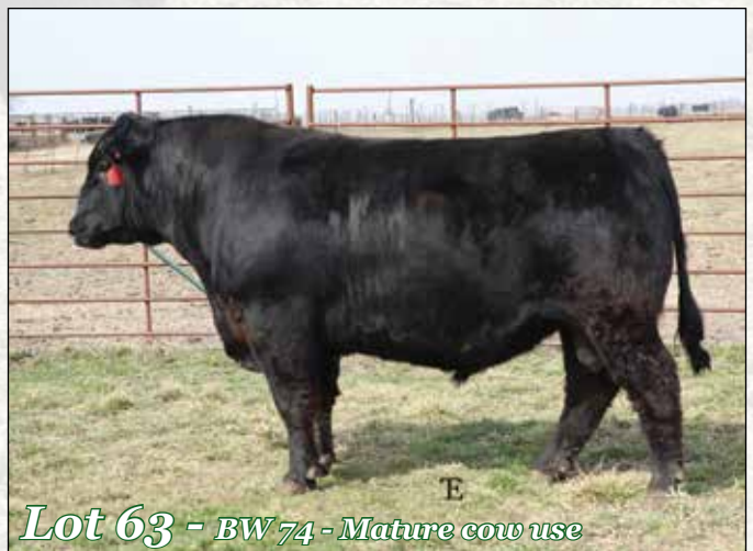
Lot 63 - BW 74 - Mature cow use