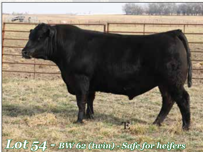
Lot 54 - BW 62 (twin) - Safe for heifers