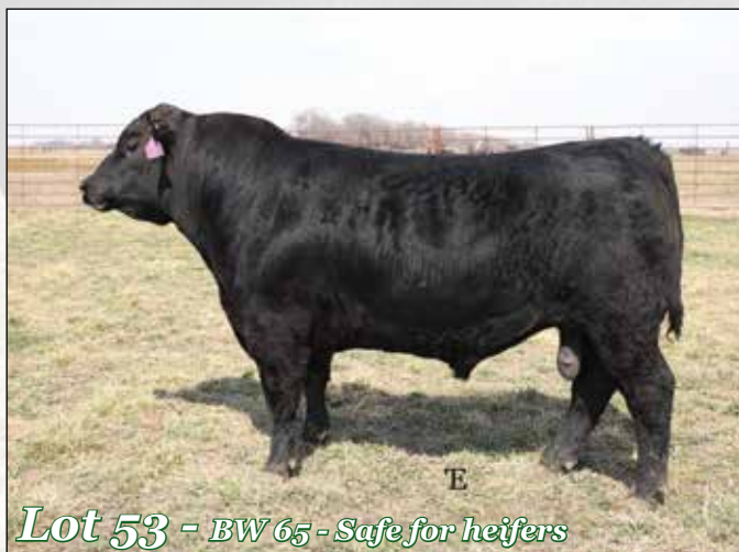
Lot 53 - BW 65 - Safe for heifers