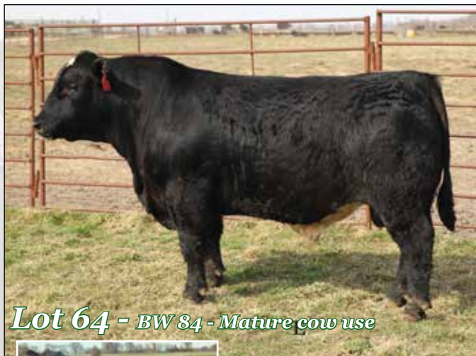
Lot 64 - BW 84 - Mature cow use